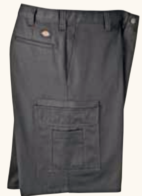
11" Cotton Cargo Short